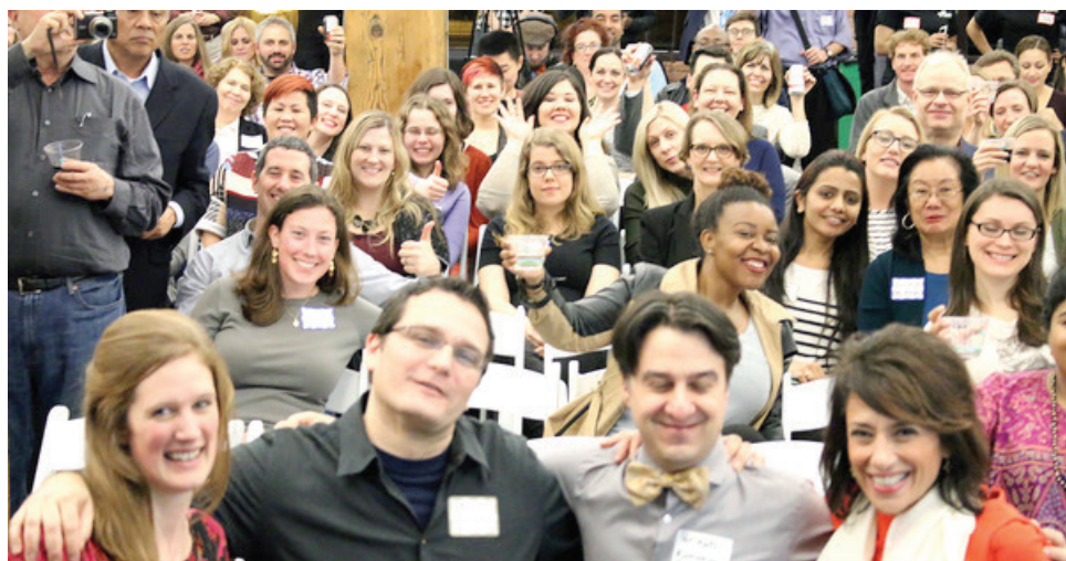
New Tech NW - Seattle 2.17.16 WIT